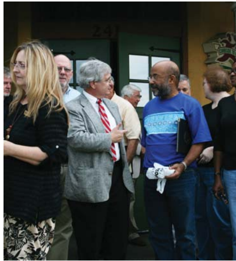
If you love to tell or listen, this is the place for you!